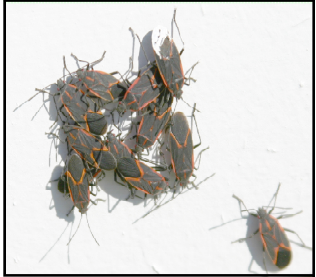
Leptocoris trivittatus Eastern Boxelder Bug