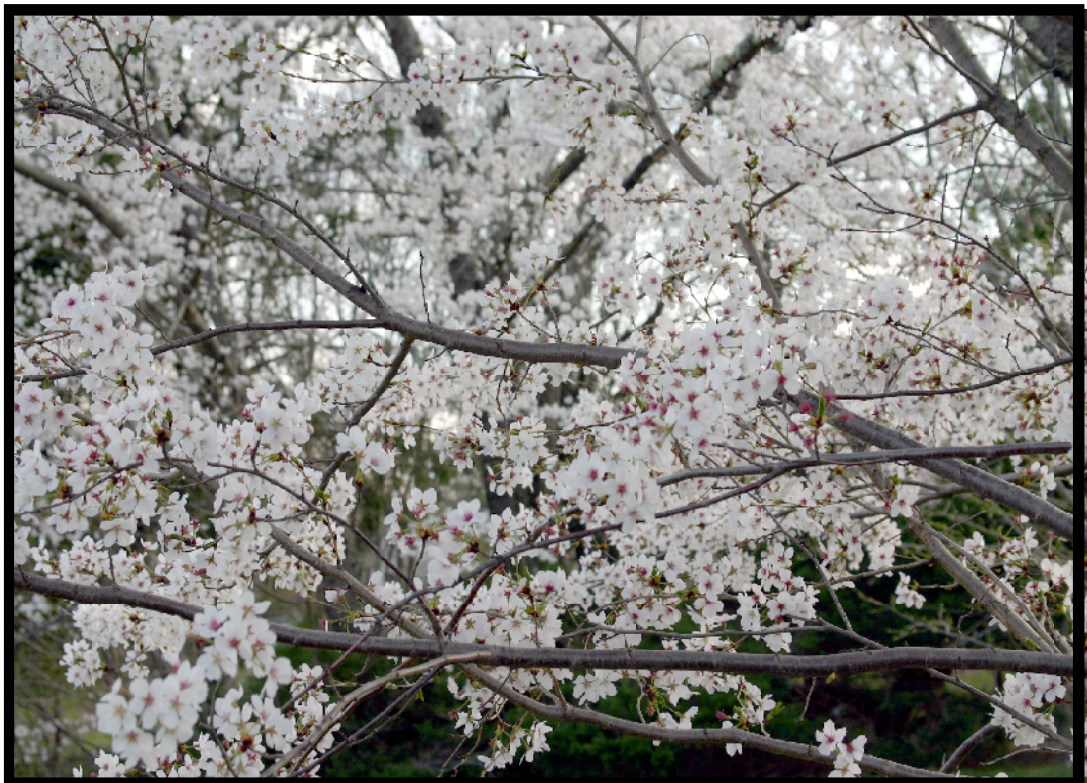
Flowering Cherry Trees on the Breeden property along the old Donovan Road